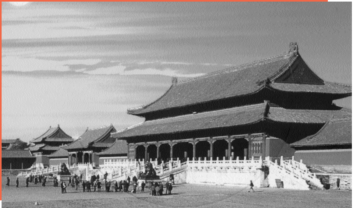
THE FORBIDDEN CITY

See the most important sites in China. Visit the The Great Wall, The Forbidden City, The Ming Tombs, The Temple of Heaven, Tiananman Square, Lama Temple. See the the heart of Chinese civilization as it was and as it is now. Fantastic shopping opportunities.