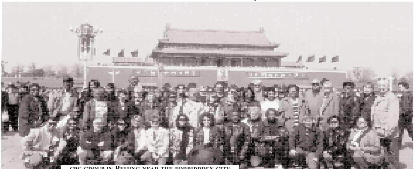
CPC GROUP IN BEIJING NEAR THE FORBIDDEN CITY

Our first destination today is Tiananmen Square, China's most famous square covering 100 acres in the heart of Beijing. On October 1, 1949 a million people gathered there to hear Mao Zedong proclaimed the birth of the Peoples Republic of China. Next we visit the Forbidden City, otherwise known as the Gu Gong (Imperial Palace). Construction of the Imperial Palace originally started in 1406 as a residence for the Ming emperors. Over the centuries twenty-four Ming and Ching Dynasty emperors lived and ruled. We plan a 'Round Table' discussion with our colleagues from the Chinese Nursing Profession. At these discussions we will exchange views