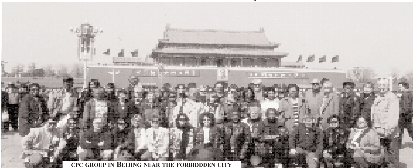
CPC GROUP IN BEIJING NEAR THE FORBIDDEN CITY

Our first destination today is Tiananmen Square, China's most famous square covering 100 acres in the heart of Beijing. On October 1, 1949 a million people gathered there to hear Mao Zedong proclaimed the birth of the Peoples Republic of China. Next we visit the Forbidden City, otherwise known as the Gu Gong (Imperial Palace). Construction of the Imperial Palace originally started in 1406 as a residence for the Ming emperors. Over the centuries twenty-four Ming and Ching Dynasty emperors lived and ruled. We plan a 'Round Table' discussion with our colleagues from the Chinese Nursing Profession. At these discussions we will exchange views