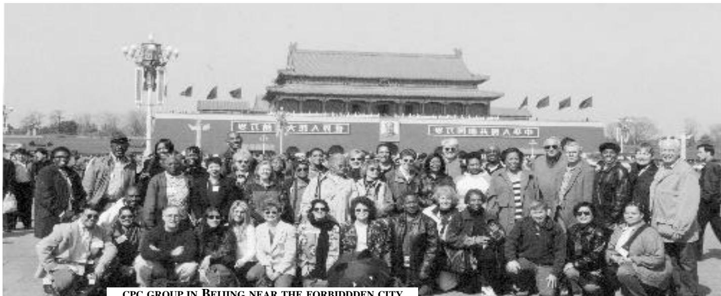
CPC GROUP IN BEIJING NEAR THE FORBIDDEN CITY

Our first destination today is Tiananmen Square, China's most famous square covering 100 acres in the heart of Beijing. On October 1, 1949 a million people gathered there to hear Mao Zedong proclaimed the birth of the Peoples Republic of China. Next we visit the Forbidden City, otherwise known as the Gu Gong (Imperial Palace). Construction of the Imperial Palace originally started in 1406 as a residence for the Ming emperors. Over the centuries twenty-four Ming and Ching Dynasty emperors lived and ruled 9. We plan a 'Round Table' discussion with our colleagues from the Chinese