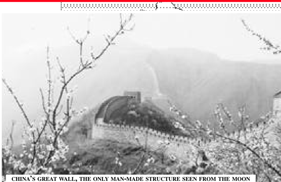
CHINA'S GREAT WALL, THE ONLY MAN-MADE STRUCTURE SEEN FROM THE MOON