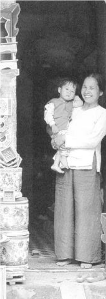
Beach T.V. series)

Next we travel to the beautiful town of Hoi via the beautiful Marble Mountains speckled with caves and shrines. Finally, we arrive at the town of Hoi where we have dinner and overnight.