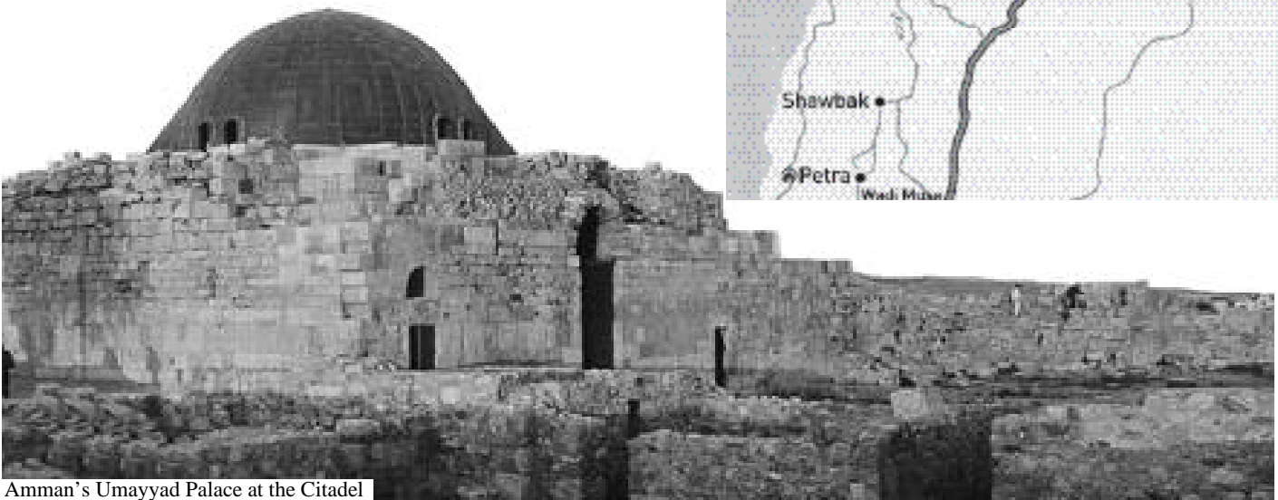
Amman's Umayyad Palace at the Citadel