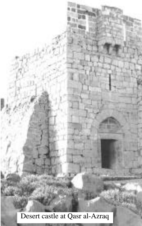
Desert castle at Qasr al-Azraq

Day 6.(B,L) Today we visit the ancient sites at Madaba, one of Jordan's most important Christian sites; then drive on to Mount Nebo where Moses is said to have first seen the "Promised Land." We end our day in Petra. (Golden Tulip Hotel)